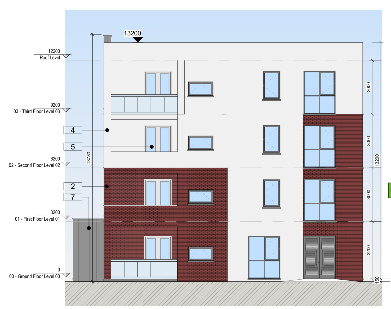
3 Right Elevation 1 : 100