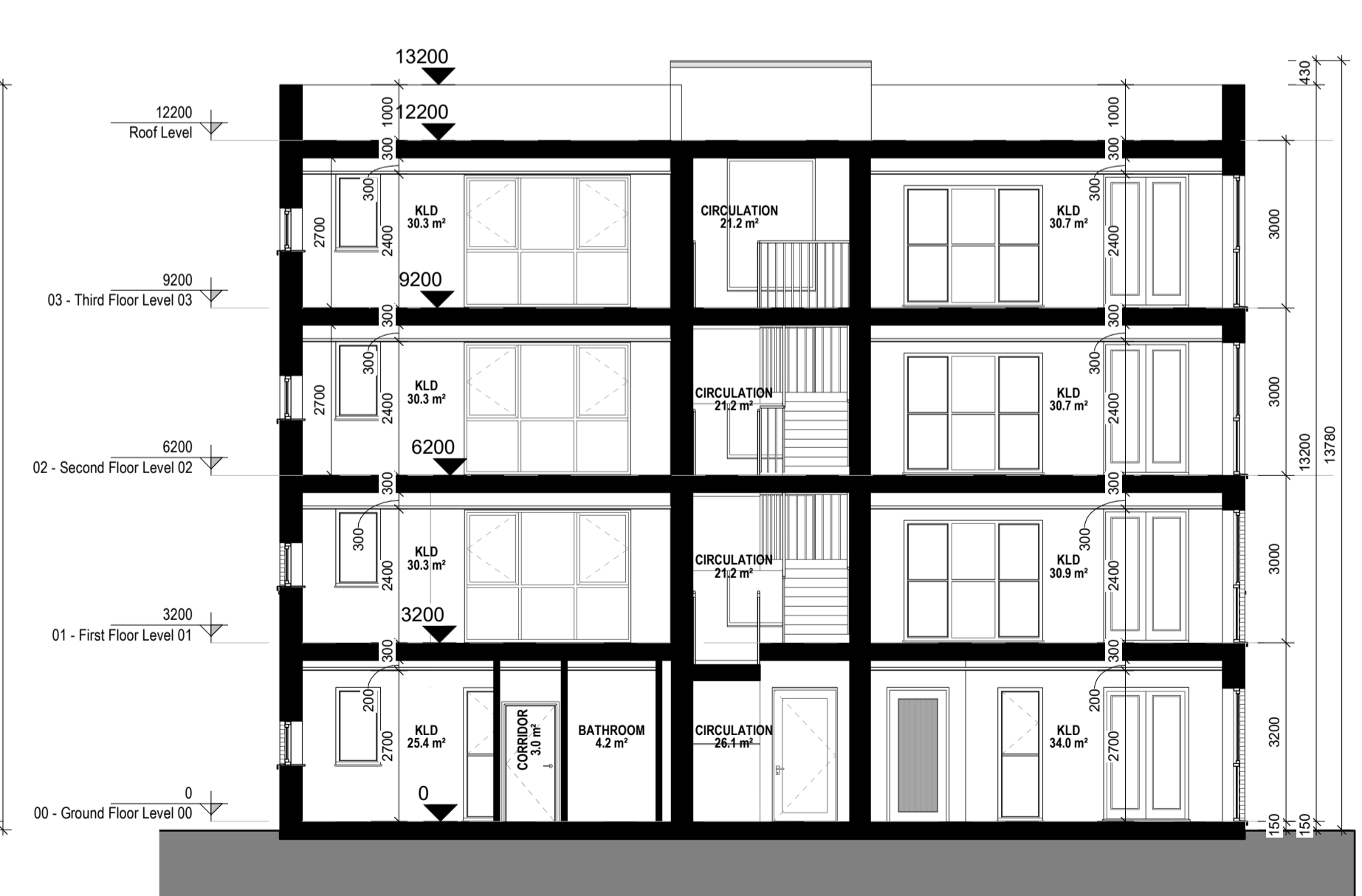
6 Section BB 1 : 100