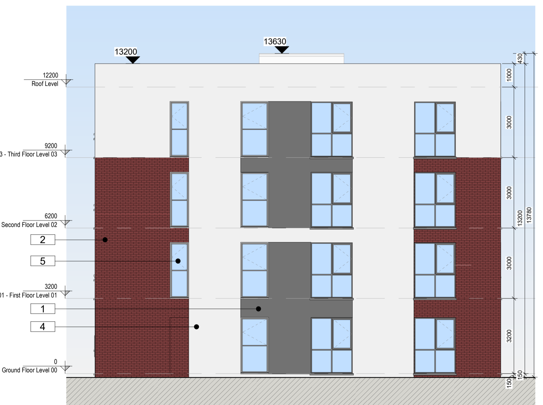
4 Back Elevation 1 : 100