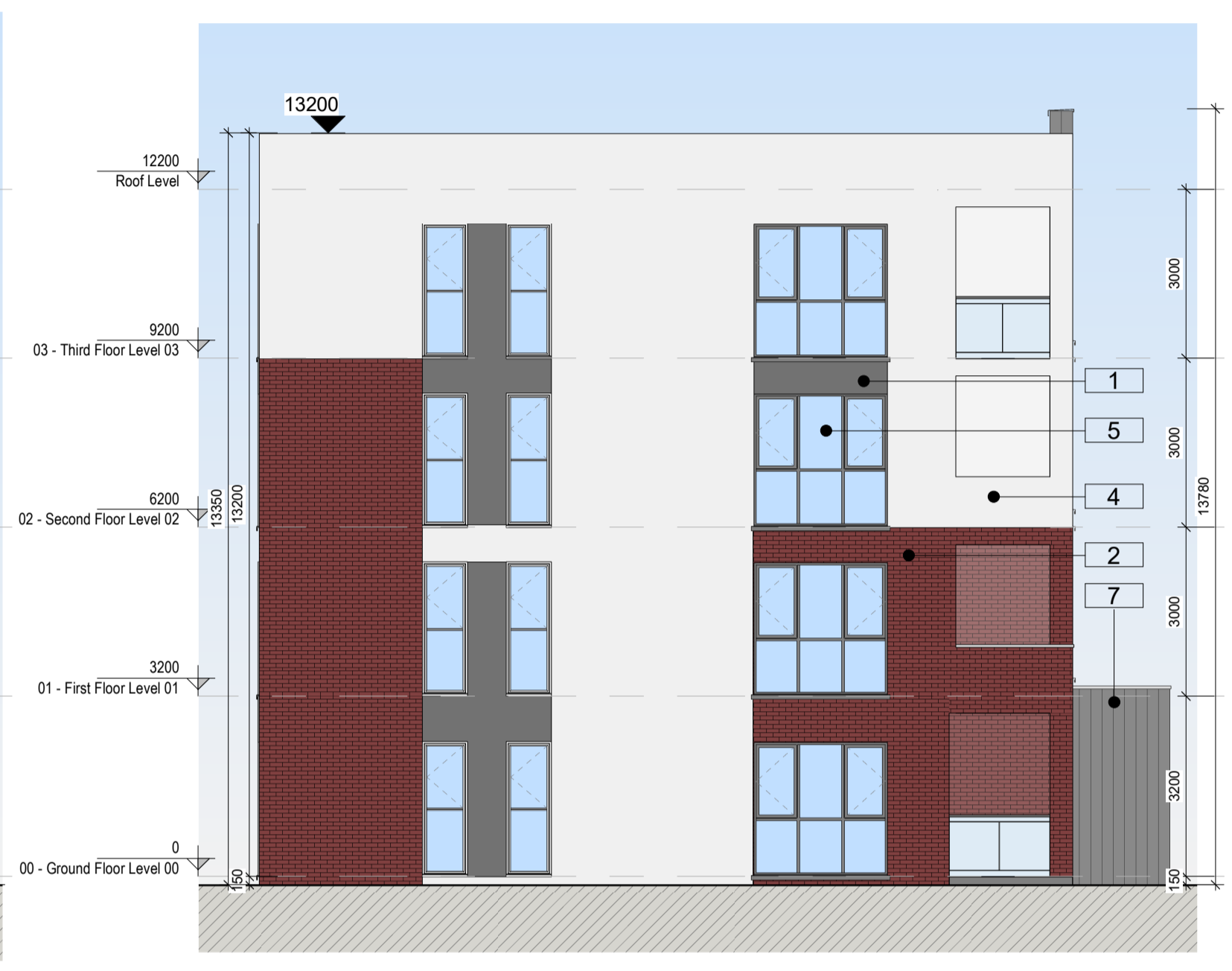
2 Left Elevation 1 : 100